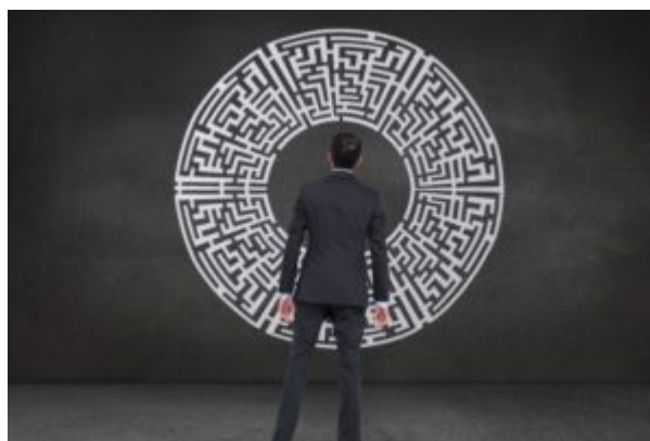
Conscious Negotiation

Notwithstanding the emotional responses, this is the first time they are conducting a conscious negotiation for the majority of them. What I call a conscious negotiation? A negotiation while being aware of the procedure one is involved in. Conscious negotiation is, contrary to its semi-automatic twin, accompanied by preparation, strategies generating and careful word selection. Obviously, we have all negotiated before we experienced our first conscious negotiation because we bargained as children: “Mum, I will be a good boy tomorrow if you only let me watching TV longer...” This is probably one of the first trades we all concluded (although we