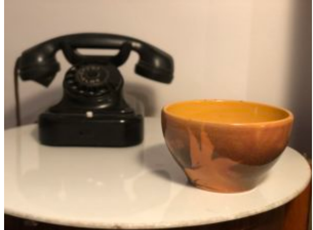
The bowl I bargained for seventeen years ago