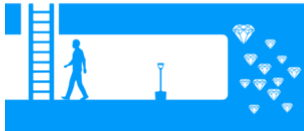
Free feet away

He sold his mining equipment and claim to a local boy for just a few hundred dollars which were only a fraction of its actual value. The buyer was as well unaware of the secrets of gold